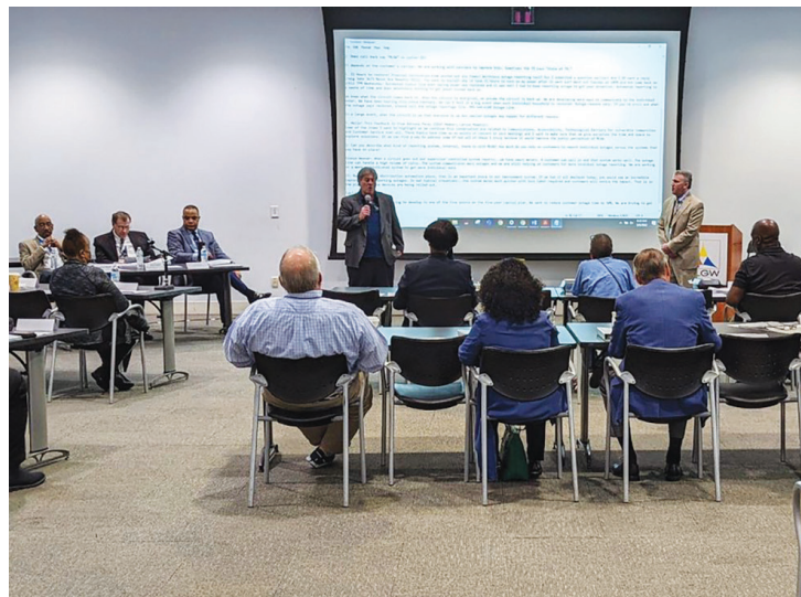
MLGW's Outage Improvement Advisory Council held its last meeting at Benjamin Hooks Main Library to further discuss approaches to improving Shelby County's outage preparation and response.

MLGW will still hold additional forums and update customers with their frequent 'Power Hour' events.