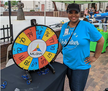
Africa in April