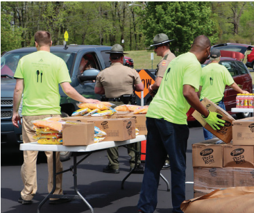
Mobile Food Pantry in Frayser