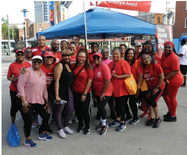
Mid-South Heart Walk