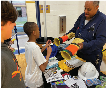
Arlington Middle School STEAM day