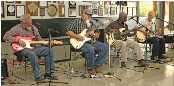
MLGW musician employees perform for other employees on a May Board day in the Administration Bldg. lobby.