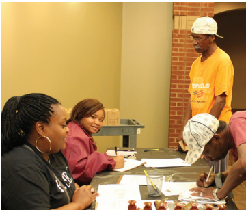
Staff at the Neighborhood Christian Center accept air-conditioning applications.

Air conditioners are not installed at addresses with operating units, or on residences with bars or storm windows. MLGW employees perform the installation of units.