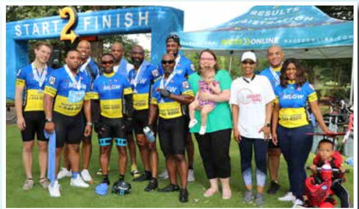
MLGW Power Riders and volunteers gather after Ride for Life for a group photo.