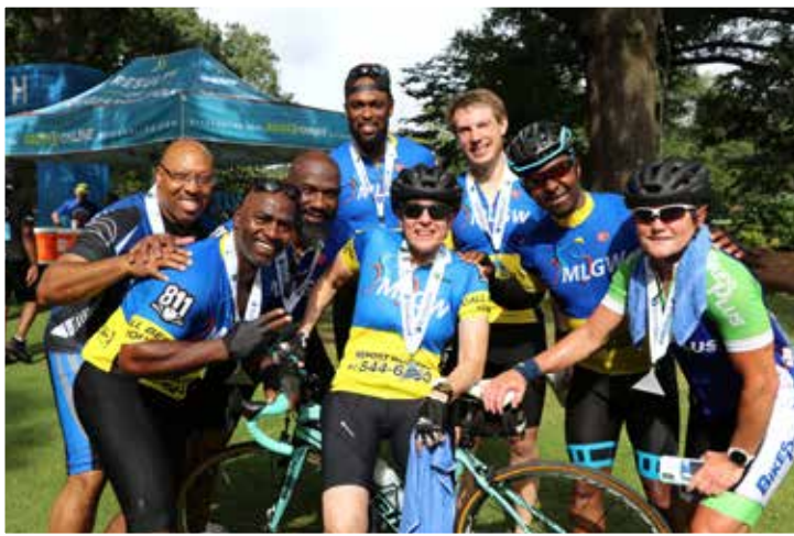
Even after many miles of bike riding for the Mid-South Transplant Foundation, MLGW Power Riders look fresh and energized. Riding for charity does that for you.