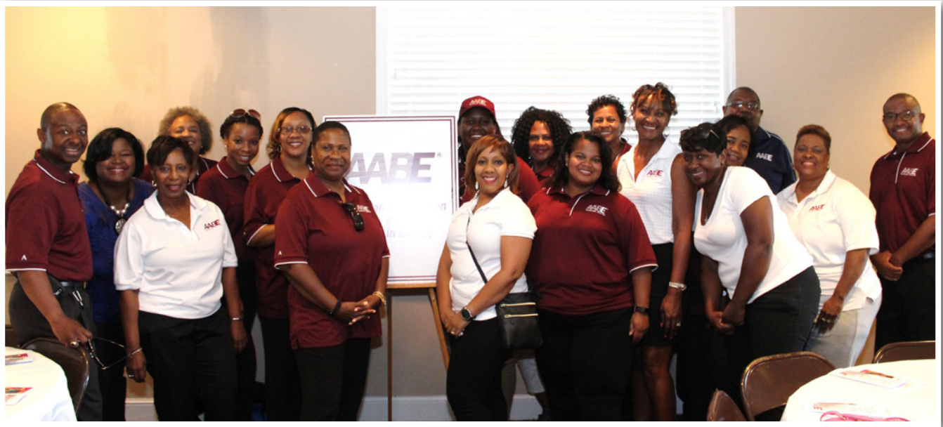
AABE Golf: MLGW's AABE volunteers organize the AABE Golf Tournament in the fall as one of the fundraising events to help fund scholarships for deserving students.