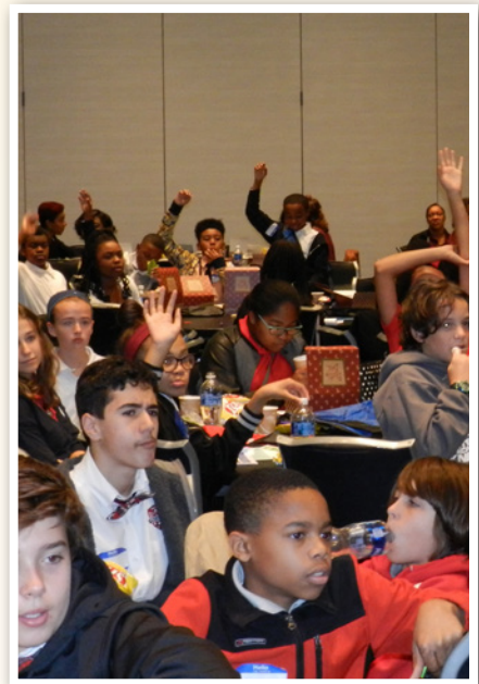
A room full of inquisitive students at AABE's STEM BEAM program at U of M is a good thing.