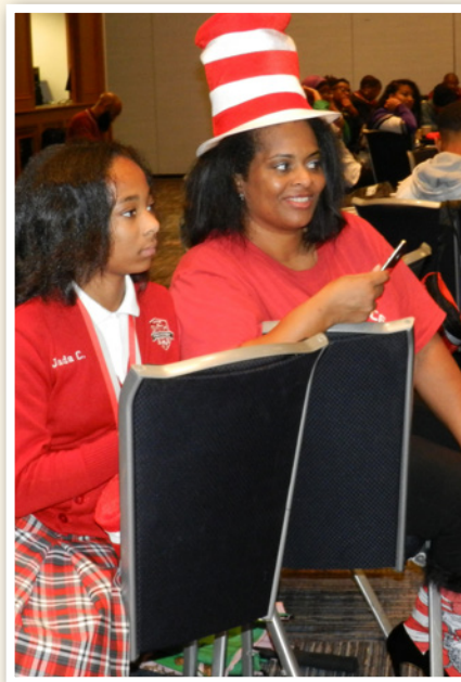
A Cat in the Hat hat adds a colorful and fun facet to engage students.