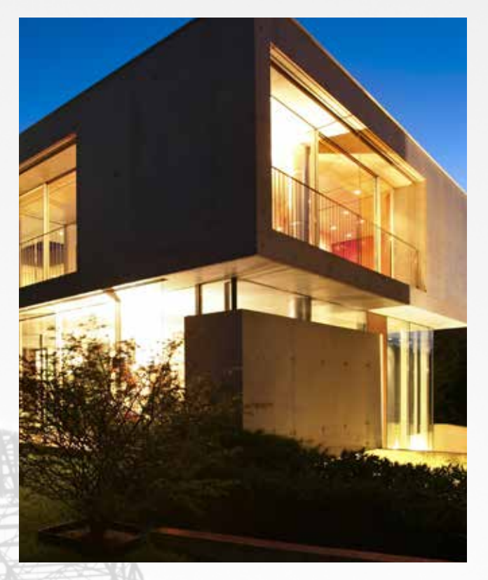
Electricity Natural Gas Water Wastewater