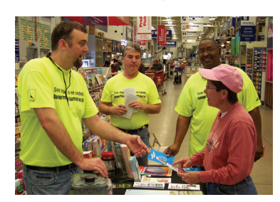
MLGW employees share information with a customer during Gas Safety Awareness Day.

MLGW and Lowe's locations in Shelby County teamed up recently to promote natural gas awareness. MLGW Gas Engineering employees staffed display tables at several locations of the home improvement chain to provide information on gas safety, which is especially relevant in the springtime.