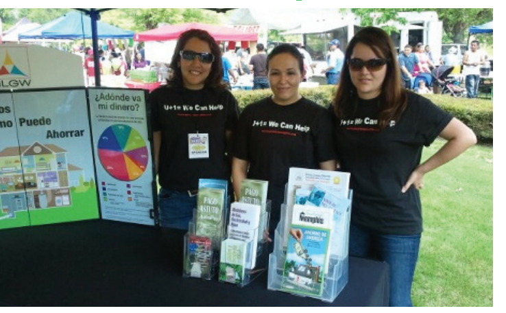
MLGW volunteers were on hand at the Children's Festival to answer customer questions and promote the utility's programs and services.

MLGW continues its commitment to the area's Latino community by implementing efforts toward outreach to Hispanic customers, most recently at Radio Ambiente's Festival del Día del Niño, an event that has celebrated Children's Day for 15 consecutive years. MLGW volunteers were on hand to answer customer questions and promote the utility's programs and services. The event, which took place at the Memphis Botanic Gardens, gathered close to 20,000 people and offered a variety of activities, food and entertainment. Other Latino events scheduled in the near future, in which MLGW plans to take part, are Latino Memphis' Cinco K Mayo Run/Walk and Latino News' International Spring Fair & Festival. both in May.