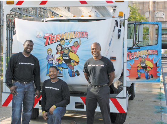
MLGW's Terminators pose with their own, unique, newly-improved Terminator Truck.

That's no longer a concern — the Terminator has his very own ride! Employees from MLGW's Communications and Public Relations led the project to restore a decommissioned bucket truck and wrap it with Terminator graphics and safety tips. Crews from MLGW's Paint and Body Shop worked their magic to make an old truck look brand new. The fun and colorful bucket truck will help promote safe energy use at home to students for many years to come. Don't be