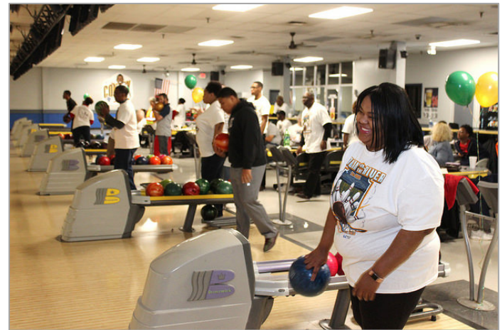
Photo, middle right: MLGW bowling teams rolled into Billy Hardwick's Lanes 4/17/2018 to compete for bragging rights while raising funds to benefit Junior Achievement during the 33 rd annual Bowlin' on the River fundraiser. MLGW bowling teams ranked second in the city for funds raised.