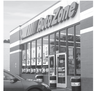
AutoZone signed up for the EnergyRight program.

MLGW won the award, in part, because of the successes with the Energy Right Solutions for Business program. Both Technicolor Home Entertainment Services and AutoZone are among the companies cashing in on the savings and rebates.