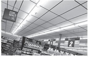
LED lights inside AutoZone

Last year, 23 AutoZone local retail stores also swapped out its existing lighting fixtures for more affordable LED lights. At each store, AutoZone's upgrades saved nearly 11,000 kWh annually and earned rebates ranging from $850 to $1,200.