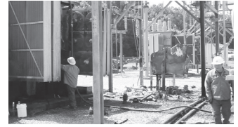
Work continues at Substation 68.

MLGW has finished partial restoration to Substation 68. Restoration should be completed by late February 2017.