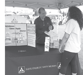
In the picture, a bilingual MLGW representative explains to a customer how to save energy while on vacation.

MLGW continues its support to the Latino community by constant participation in special events that cater to that segment of our community. MLGW is always present at such events with information on how to save energy for a lower monthly bill, how to stay safe around utilities, and how to avoid