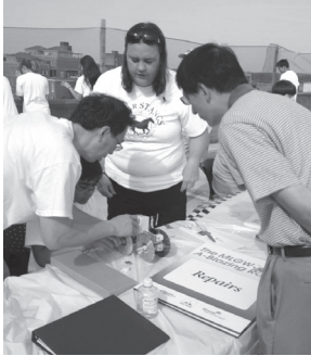
Volunteers make repairs to a model solar car during the A-Blazing Race.

MLGW has successfully completed its second A-Blazing Race, a model solar car race for boys and girls in grades third through eighth grade. The race was held Saturday, August 16 at MLGW's Beale Street Landing parking garage rooftop.